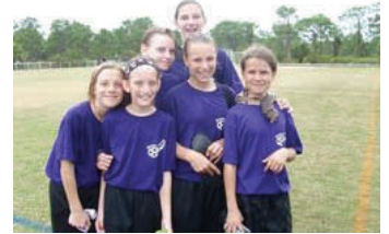
Kids make all kinds of new friends playing soccer in Malabar

Community Park. He also operates his own landscaping and land clearing business. As fields coordinator, he is responsible for coordinating the maintenance of the field and the marking of the lines. If you would like to become a part of his team, please stop him at the field, or contact us at MalabarSoccer.com.